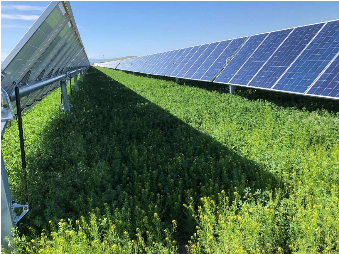
Photo 1. Summertime photo from a solar energy facility owned by Heelstone in Oregon. This photo is intended to demonstrate typical vegetative cover conditions—an approved native species seed mix can be used in the array area to provide cover and foraging habitat for small mammals and birds.

Apart from the access road, the majority of the area within the fence will not be graded, compacted, filled, or paved. Therefore, we anticipate that the area will have similar ecological and hydrologic functions as does the current pasture area. The panel racking system will be supported on piles, metal posts driven into the ground without concrete footings (Photo 1).